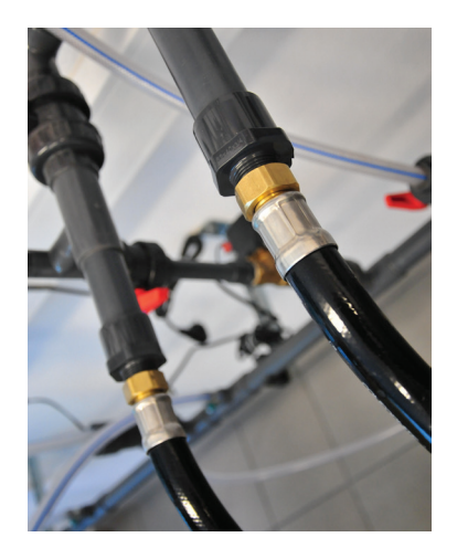
Clip ends: into by-pass Thread ends: into piping